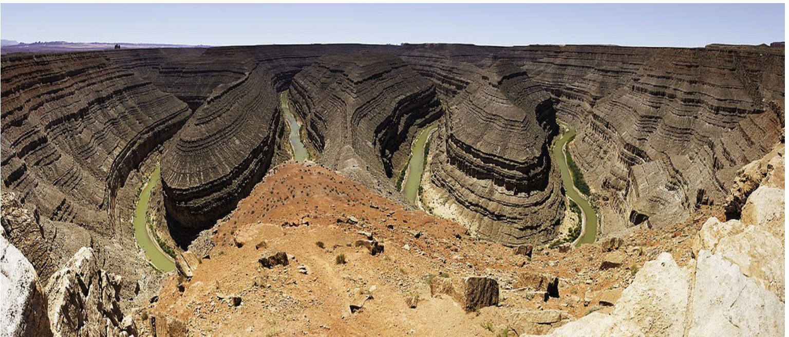
The Goosenecks – along the San Jaun River in Utah. Photo by Gernot Keller A large version of this photo is available on Wikipedia

AFMS WEBSITE http://www.amfed.org/ EFMLS WEBSITE http://www.amfed.org/efmls/