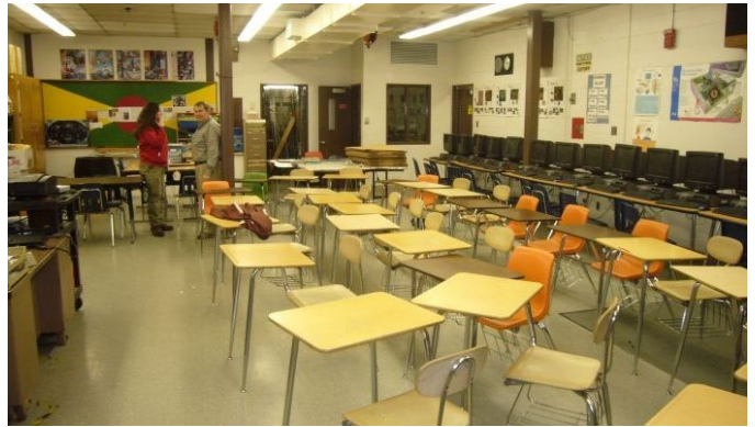
View toward the front of the Technology Classroom