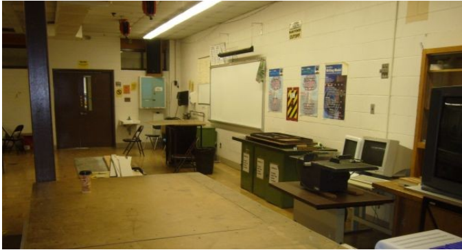
View of the Shop Area

The bill for the rental of the New Milford High School Cafeteria (for the annual show) came to $1112 and has been paid as has the bill for the