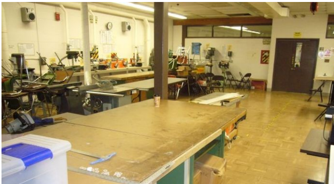
Second view of the Shop Area

Our objective was to evaluate the cafeteria/ auditorium facility for use by the DMS for regular meetings and possibly using the shop space for projects that might include lapidary and other crafts.