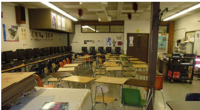
View to the rear of the Technology Classroom

Our objective was to evaluate the cafeteria/ auditorium facility for use by the DMS for regular meetings and possibly using the shop space for projects that might include lapidary and other crafts.